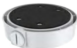
A22a Junction Box