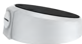
A22b Junction Box